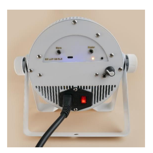
LED Status Chang to Green

1. Plug the headset audio cable into the device Headset Socket .