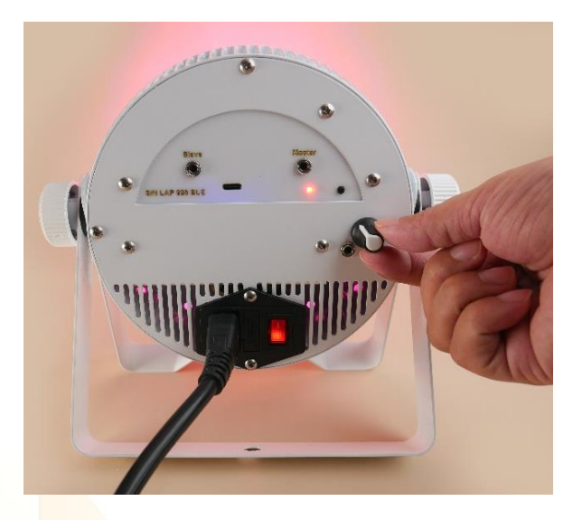
Turn the Sensitivity Knob to the right