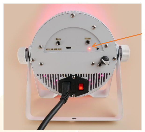
LED Status Bluetooth mode

1. When the device is turned on, the first light is the red light will always be the Bluetooth light status. This function is needed to connect or pair Bluetooth with Mandala Star Application.