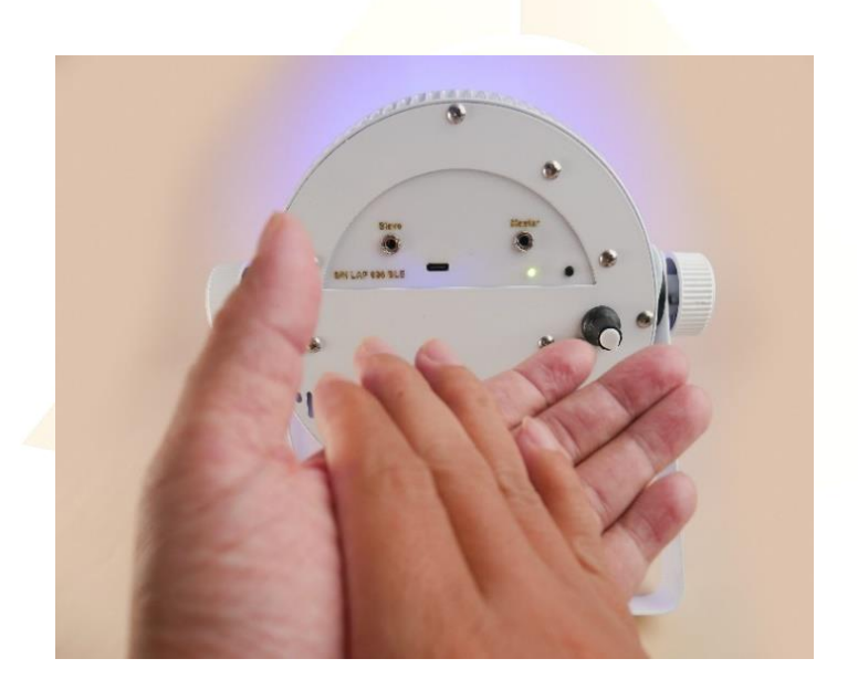
Clap your hands, Light Alchemy will flash according to your applause.

3. Bluetooth audio mode is the third mode of Light Alchemy, the light Status is Green. LED in this mode, the light can be adjusted and pulse according to audio/music frequency. For Bluetooth Audio, users need to pair Bluetooth from tablet/smartphone setting to connect with another Audio Bluetooth named "XY-ABT".